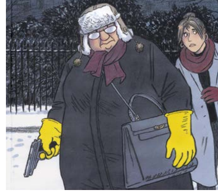
«Cassandra Darke», 2018