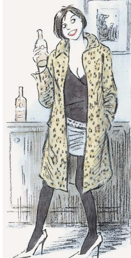
«Tamara Drewe», 2007